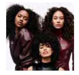
WELCOME TO L'ORÉAL PROFESSIONNEL

Virtual Ateliers: Inspirational, complimentary education for all. Our education team hosts these 90 minute high impact workshops weekly for hairdressers all over the US. They cover many topics from foundational product knowledge through to inspiration and technique.