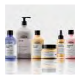
CARE & STYLE ESSENTIALS